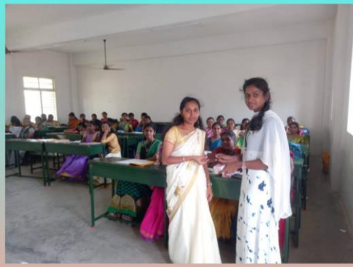
Distributing Albendazole tablets to I B.com CA students