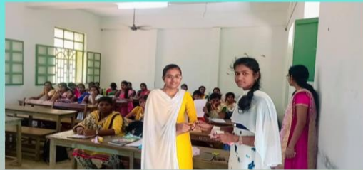
Distributing Albendazole tablets to I BA.English literature students